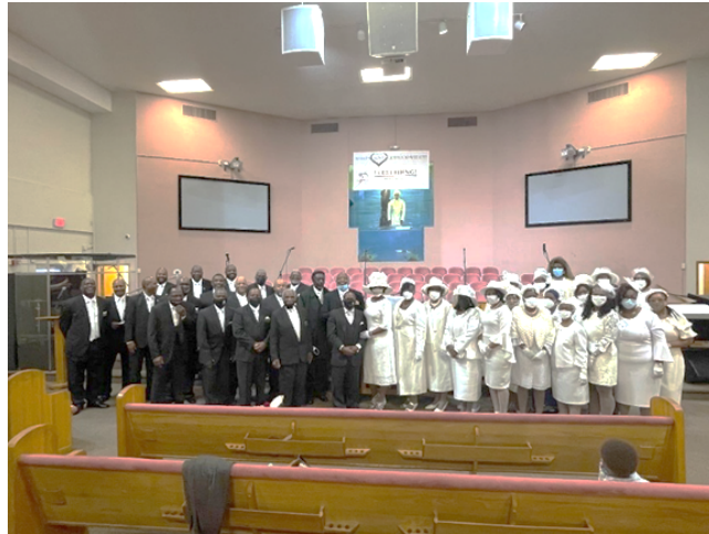
AFTER THE INSTALLATION, THIS PHOTO OF PASTOR, DEACONS, AND DEACONESSES WAS TAKEN.