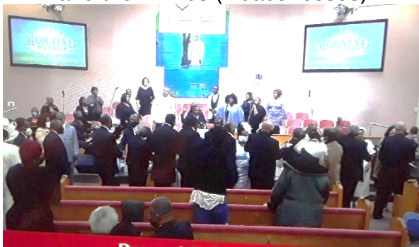
Deacons fellowship with new Deacons and new Deaconesses.