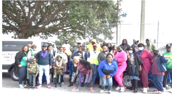
PHOTO FROM DR. MARTIN LUTHER KING, JR. PARADE ON JANUARY 17, 2022