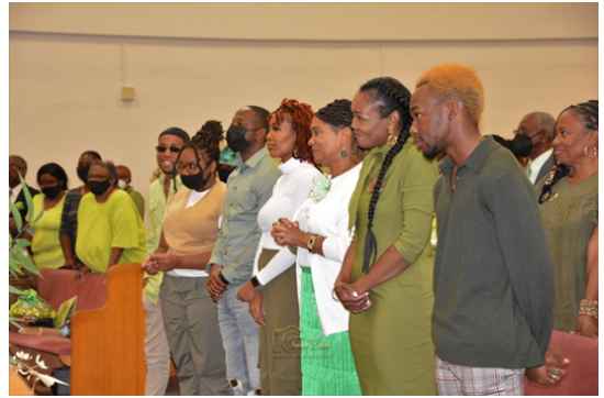
The Pastor's Family