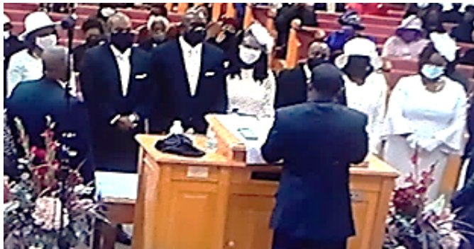
The new Deaconesses stand beside their husbands as Pastor gives them their charge.