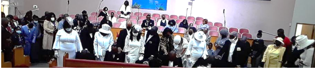
New Deacons being surrounded in prayer by their mentors and family members.