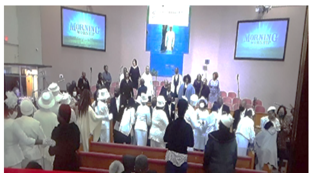
Deaconesses fellowship with new Deacons and new Deaconesses.