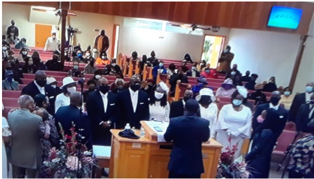
Pastor gives the charge to new Deacons and their wives (Deaconesses).