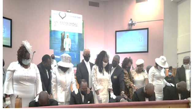
Prayer with the laying of hands.